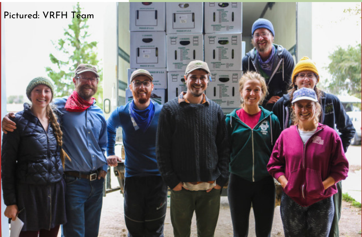
Pictured: VRFH Team